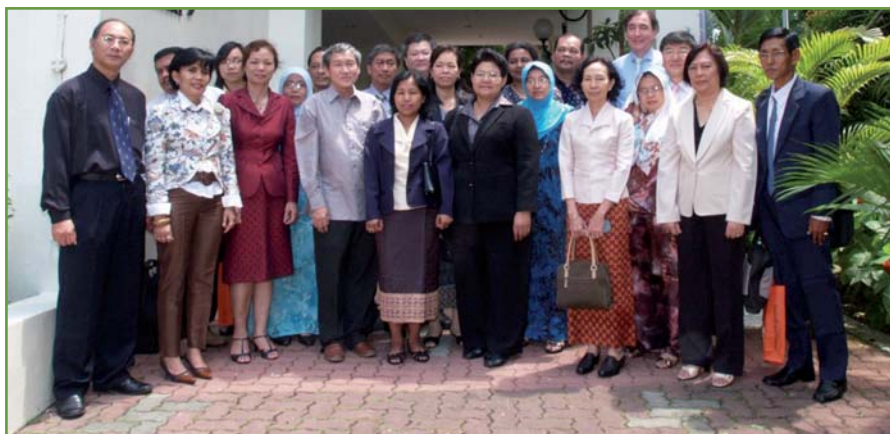
SARBICA, Singapore 2009.