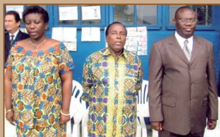
The Deputy Director of the National Archives of the Democratic Republic of Congo, His excellence, the Minister of Culture and Arts, The Director of the National Archives of the Democratic Republic of Congo.