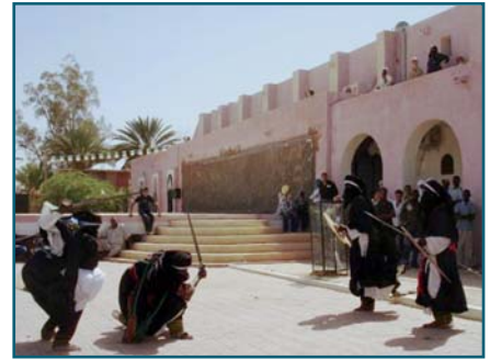
EB Tamanrasset 2009, the desert.

tegy because it had very different meanings in different countries; that a revenue-generating entity could derive its status from the ICA constitution, rather than operating as a legal body in its own right; that changes to the constitution, which would clarify the organization's remit in the area of revenue-raising, would be proposed to the AGM in Malta in November 2009; and that expert legal advice would be sought on how far existing ICA structures could provide a basis for revenue-generating activities.