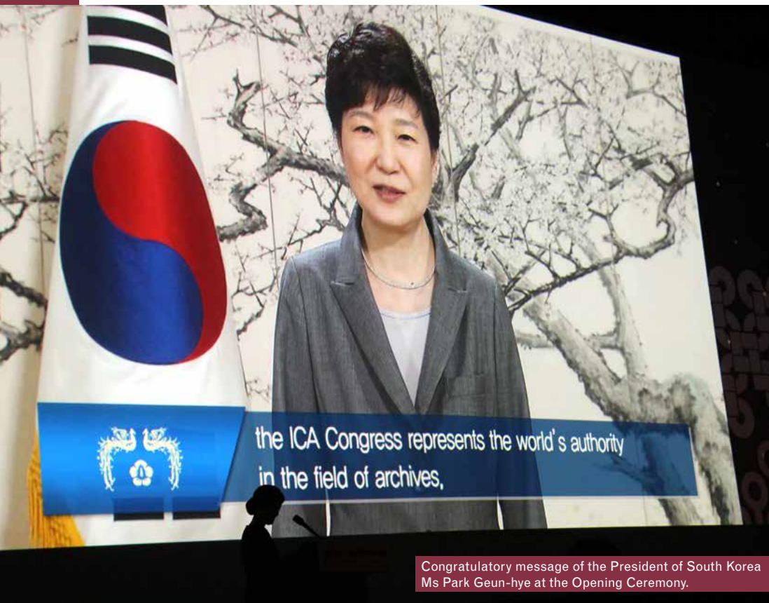
Congratulatory message of the President of South Korea Ms Park Geun-hye at the Opening Ceremony.

WE TAKE THIS OPPORTUNITY TO THANK OUR PARTNERS: