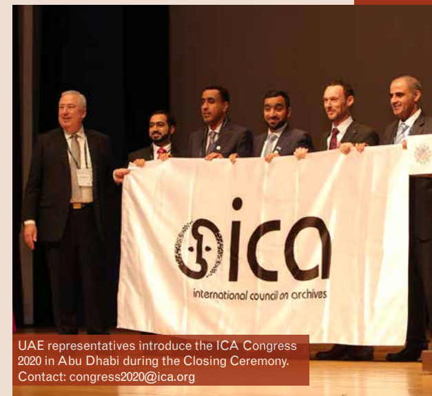
UAE representatives introduce the ICA Congress 2020 in Abu Dhabi during the Closing Ceremony. Contact: congress2020@ica.org