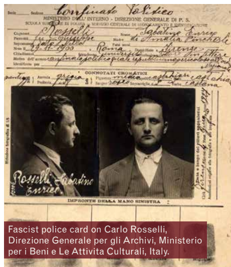
Fascist police card on Carlo Rosselli, Direzione Generale per gli Archivi, Ministero per i Beni e le Attività Culturali, Italy.