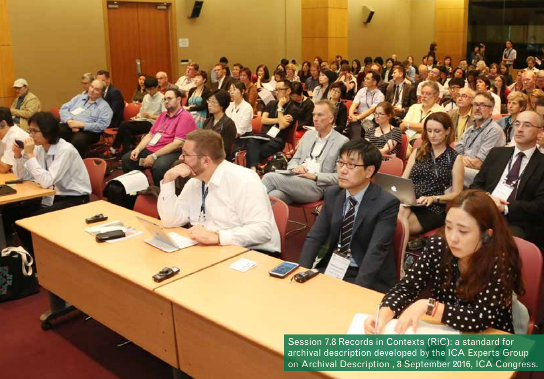
Session 7.8 Records in Contexts (RiC): a standard for archival description developed by the ICA Experts Group on Archival Description, 8 September 2016, ICA Congress.

a record may be a member of many groups, concurrently or over time, and allows such complexity to be described. Then there are entities that allow the description of the contexts in which records exist: their topics; the agents, who in particular occupations and positions, create, manage and use records; the functions and activities of those agents, the execution of which give rise to records; and the times and places in which all these events take place.