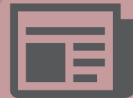
Newspapers and magazines