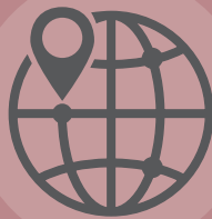
Maps and floor plans