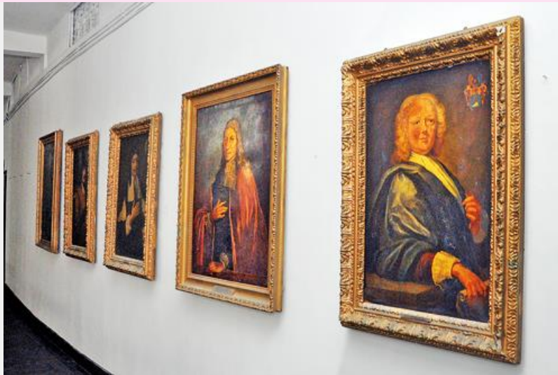
Governors' Gallery: A row of paintings by a unknown artist.

With repositories for documents spanning 22km, a conservation department and a state of the art search room and film repositories, there are many things of interest at the Department of National Archives. A series of paintings of the governors of Ceylon from Dutch times by an unknown artist, line the first floor of the old building, raising more questions than answers -how the artist knew what all of the governors painted actually looked like; the nationality of the artist, his/her reason for painting all of these portraits etc.