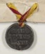
Papal Bull confirming privileges of the University of St Andrews by Pope Benedict XIII, 28 August 1413 (Ref: UYUY100)

[A list of names or signatures at the bottom of the document, including names like Benedictus, etc.]