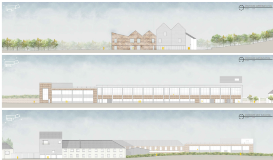
New Eden Campus Design