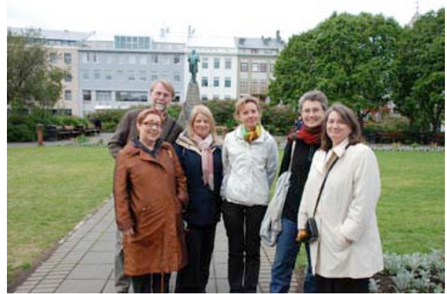
SUV board members and Reykjavik university archivist meeting in Iceland, June 2009