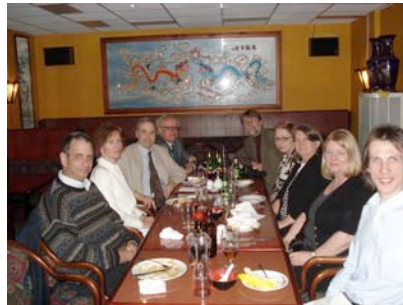
SUV board members, Uppsala 2008