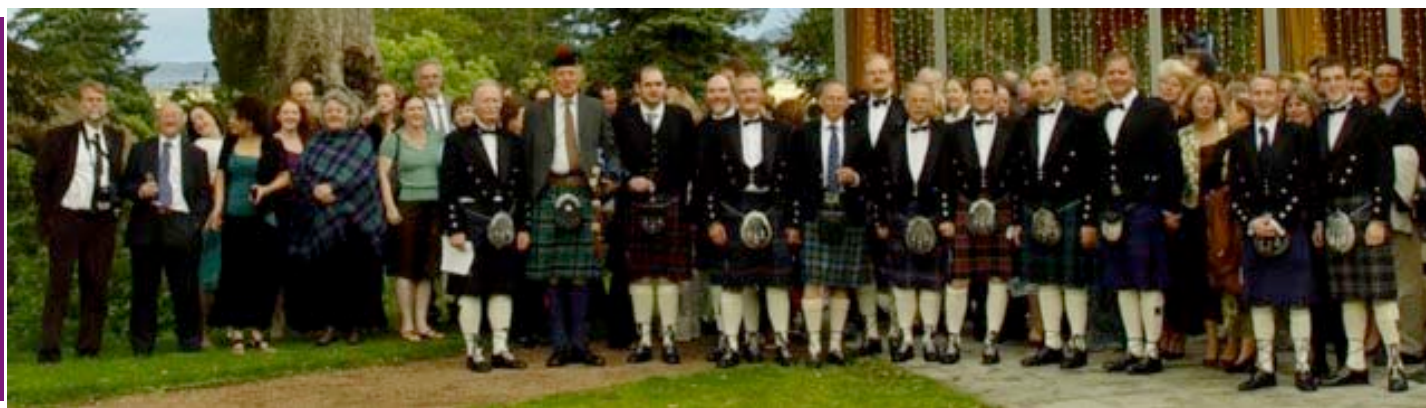
ICA-SUV Annual Conference in Dundee, Scotland, 2007