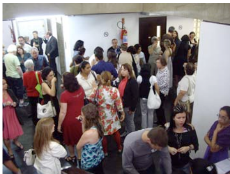
SUV Conference Rio de Janeiro, Brazil, September 2009